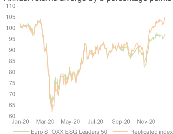
RA.5 ESG equity indices performance Annual returns diverge by 8 percentage points

Note: Euro STOXX ESG Leaders 50 Index and replication index using Refinitiv ESG ratings, rebased with 1/1/2020=100.